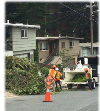
3. Wait for Chipper to Remove Materials

The Pacifica Vegetation Reduction Chipping Program was made possible through collaborated support of North County Fire Authority, the City of Pacifica, and Coastal Conservancy grant funds.