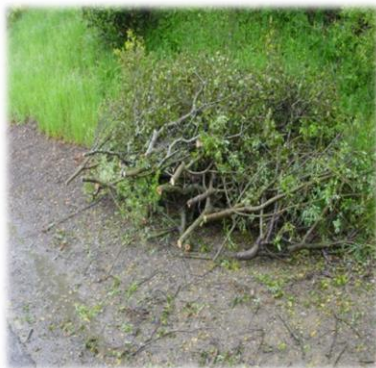
1. Leave Cut Vegetation adjacent to Curbside with cut ends out.

Leave your cut vegetation adjacent to your property curbside before 8:00 a.m. no more than 7 days prior to the scheduled chipping date. Stack cut ends towards the street. Limit your pile to 10' wide by 10' long by 5' high. Do not obstruct the roadway when stacking material. Branches may be up to a 10" diameter. The chipper will chip and remove the material.